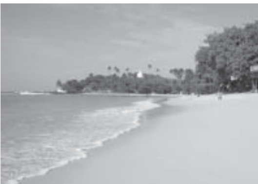
<< Picturesque Golden Beach, Unawatuna

in partnership with the Tourist Board to secure project-by-project funding from corporate sponsors.