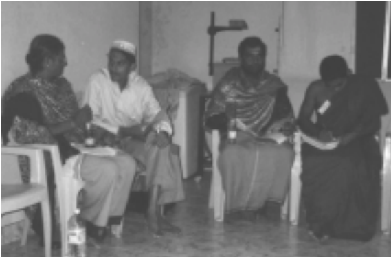
>> A recent Peace building workshop at Ampara

The workshops aim to promote coexistence between and among different ethnic groups, religious groups, IDPs, returnees and host communities whilst promoting religious leaders and civil society's participation in the ongoing conflict resolution process at the grass-roots level.