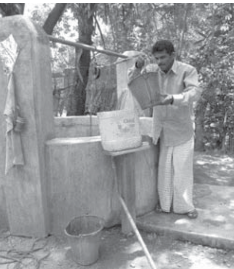
<< Pipe well, Trincomalee