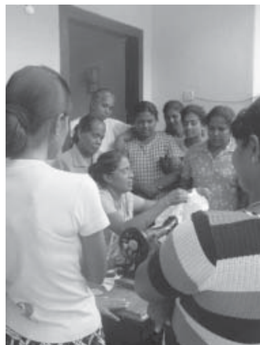
>> Participants in a recent dressmaking workshop

The second and third phase of the project planned to commence in 2004 will address basic infrastructure issues, like inadequate sewerage and solid waste removal. The project brief will also examine working with existing projects in the South to supply provision of pure drinking water into homes and hotels and repair interior roads. The project aims to look at establishing a tourist and environment centre and the creation of a web site to inform and attract tourists from all over the world. A series of awareness campaigns are also planned, targeting school children and other members of the Unawatuna community on the importance of environment and culture protection for the success of sustainable tourism in Unawatuna. ■